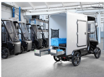
The underfloor module was designed by Mubea in cooperation with the company Bott especially for craft businesses.

Pictures: You can find all pictures in print quality at: https://www.mubea-umobility.com/inside-u-mobility/media