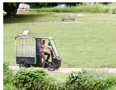
WORK offers a special buildup for the garden landscape sector as well as cities and municipalities.